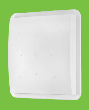
UHF 5 series