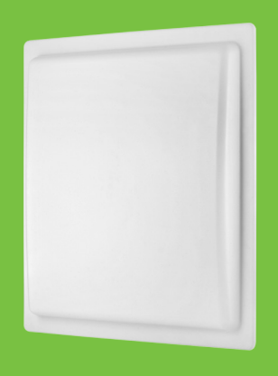
UHF 10 series